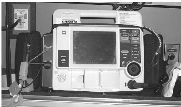
Figure 1 Defibrillator.