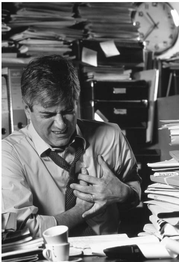
Figure 2 Patient with chest pain.

For patients with chest pain—respiratory, cardiovascular, abdominal, and musculoskeletal examinations are appropriate.