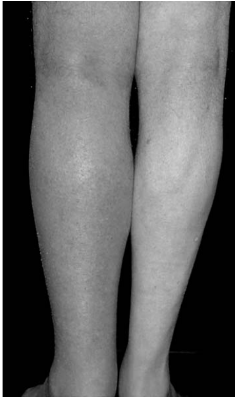
Figure 5 Deep venous thrombosis.

reveal a difference in the blood pressure between the left and right arm. There may be murmurs heard over the back (fig 4).