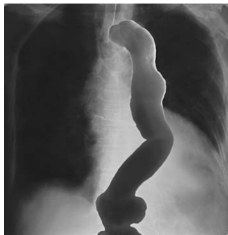
Figure 4 Dissecting aortic aneurysm.

Typically the patient presents with severe, “ripping/sharp” chest pain radiating through to the back. Diagnosis is difficult but is made easier by thinking of the condition, particularly in those with a higher risk (for example, hypertension or Marfan’s syndrome). Examination may